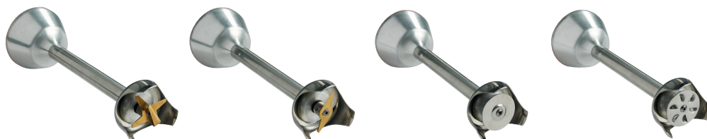
Emulsifying knife - 4 blades Ref. : AC520