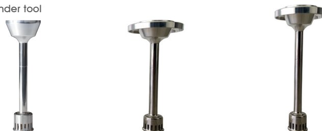
Ref. : AC560