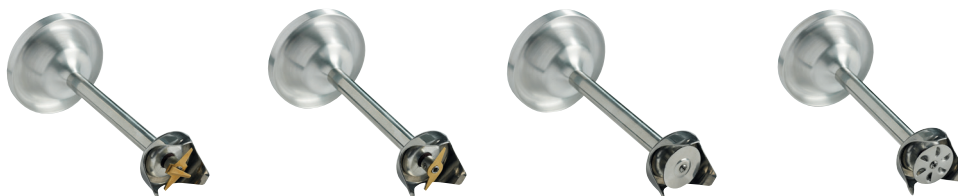
Emulsifying knife - 4 blades Ref. : AC530